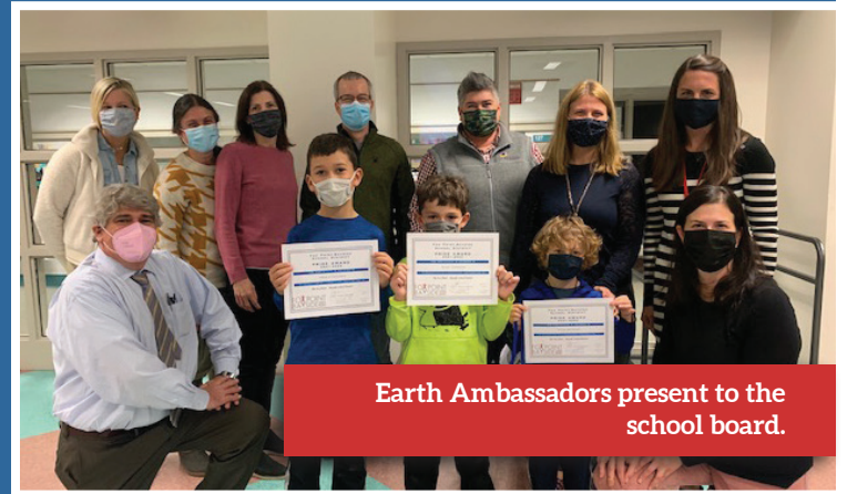
Earth Ambassadors present to the school board.