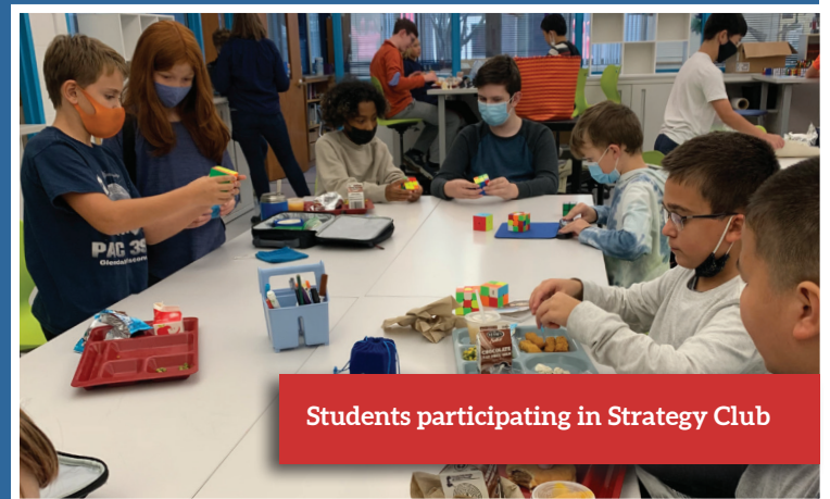
Students participating in Strategy Club

New this year, Strategy Club offers students fun and challenging activities, including solving Rubik's Cubes and playing Chess.