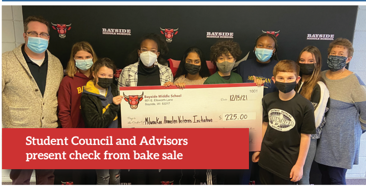
Student Council and Advisors present check from bake sale