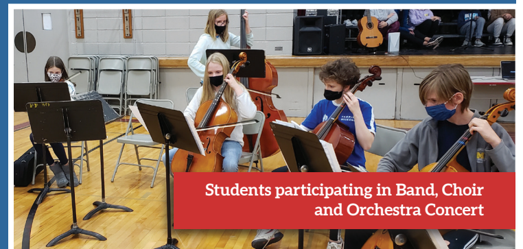
Students participating in Band, Choir and Orchestra Concert

The Boys Basketball season got underway on December 6 with 34 boys participating.