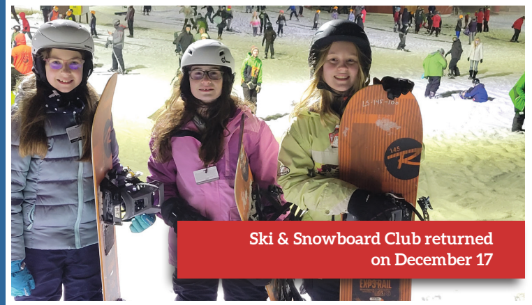
Ski & Snowboard Club returned on December 17

Late fall and early winter brought exciting opportunities for Bayside students to once again participate in several in-person clubs and groups, many of which were offered across all grade levels. Among these were Student Council, STEAM Club, Strategy Club, Forensics, Ski & Snowboard Club and, debuting in January, Sewing Club!