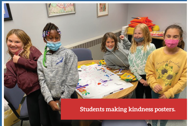
Students making kindness posters.