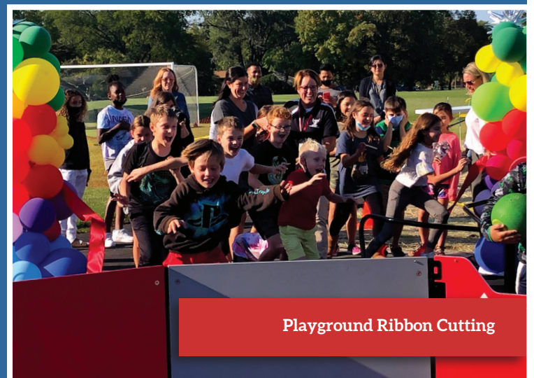
Playground Ribbon Cutting

The STEAM Club features professionals presenting topics and hands-on activities to students relating to careers in science, technology, engineering, art and mathematics.