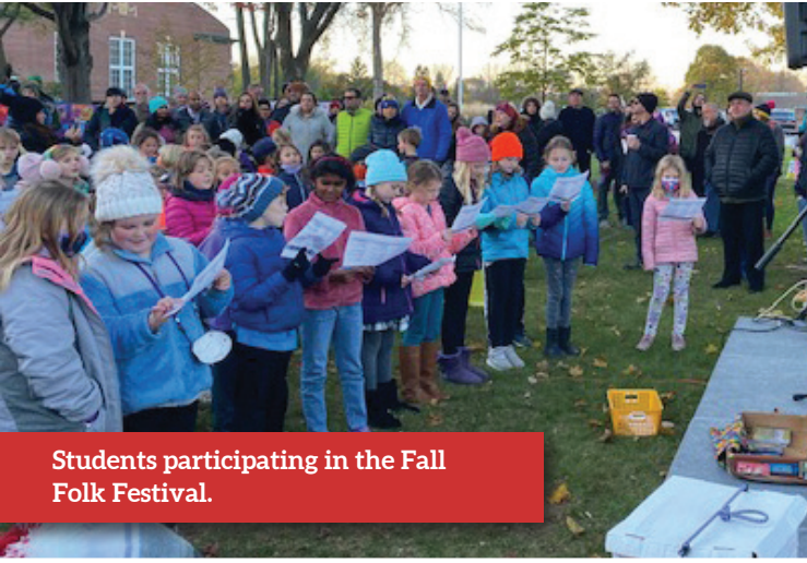
Students participating in the Fall Folk Festival.

The 2021-2022 school year is in full swing! In addition to the strong academics we offer, Stormonth provides opportunities for students to expand their learning in non-traditional ways, growing creatively through clubs and extracurricular activities.