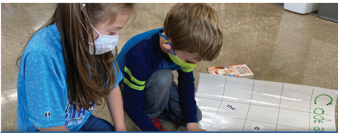
K5 students practicing snap words with Code and Go Mouse robots.