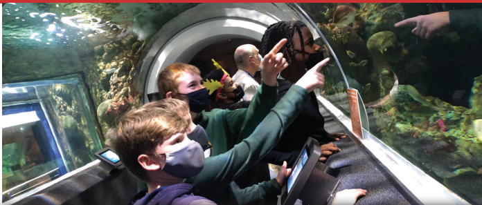
6th grade students enjoying Discovery World field trip.