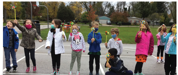
1st graders learning about wind, speed and direction.