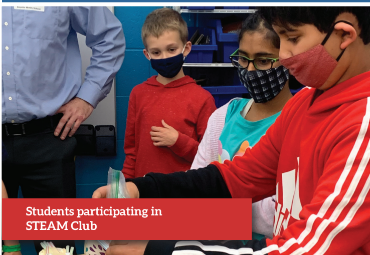
Students participating in STEAM Club