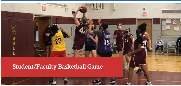
Student/Faculty Basketball Game

Bayside students also enjoyed the return of some wonderful field trips including a 7th & 8th grade trip to a Nicolet High School Theater production in November and a December visit to Milwaukee's Discovery World Museum for 6th graders.