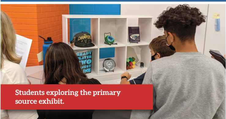
Students exploring the primary source exhibit.