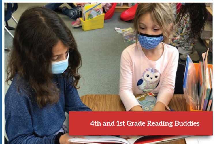
4th and 1st Grade Reading Buddies